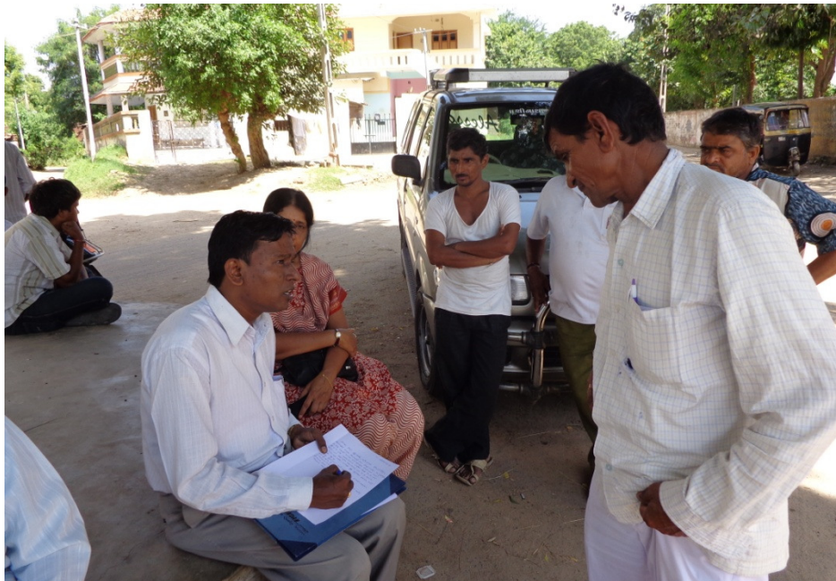
Officers' Surprise Field Visit