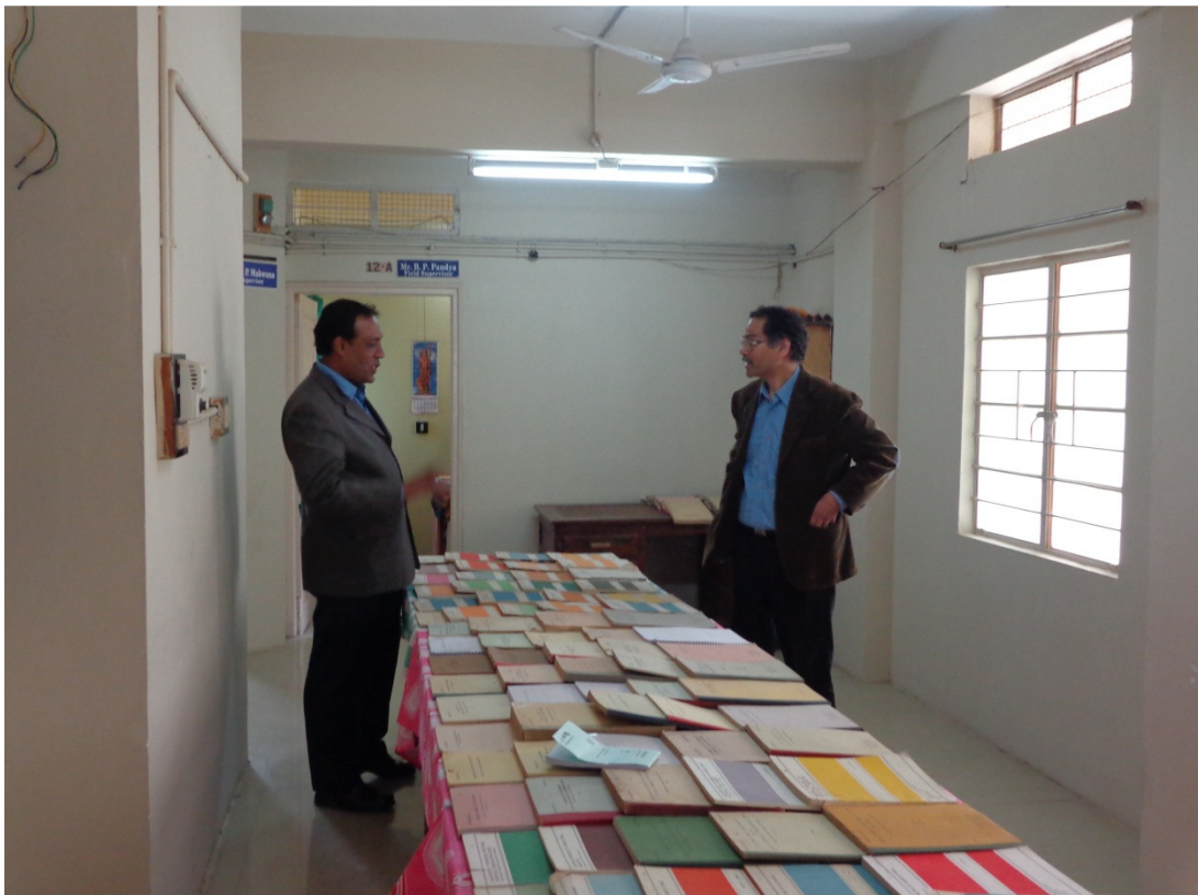
Display of AERC Report (1961-2013)