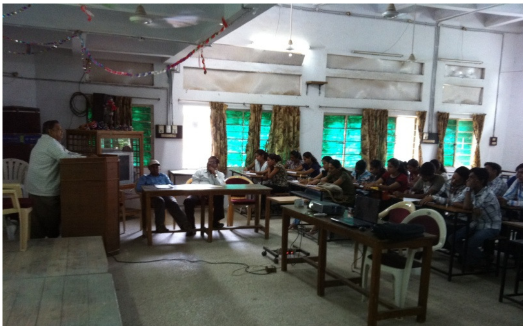
RAWE Programme of Dept of Agril. Economics, Anand Agricultural University, Anand