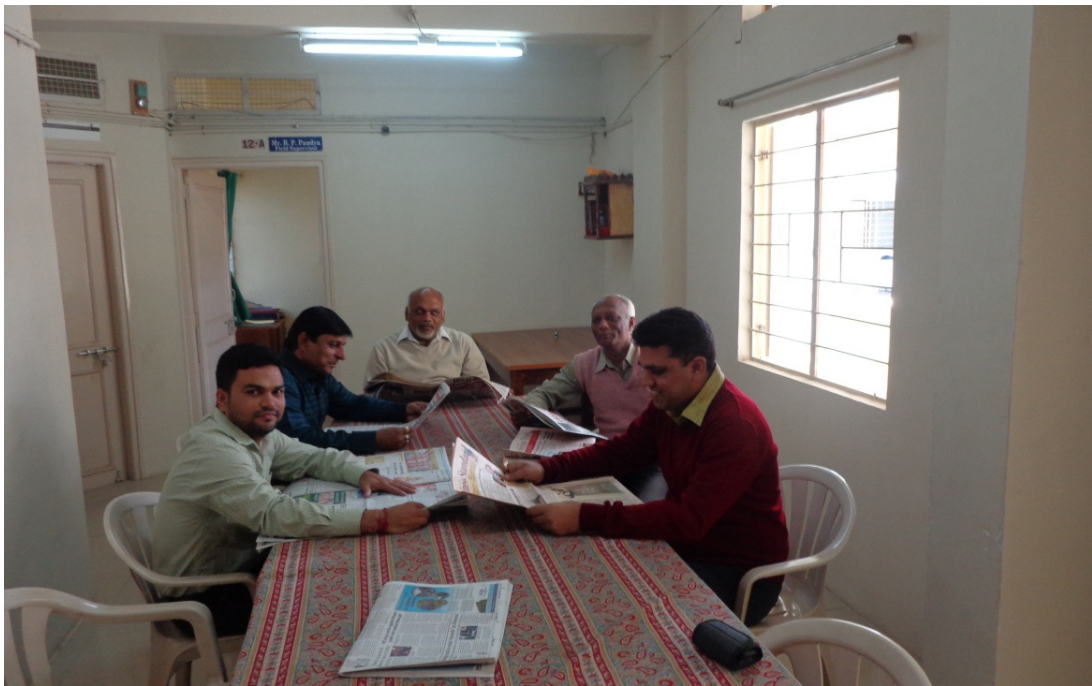
Reading Hall, AERC