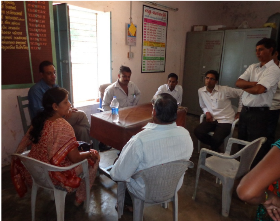
Officers' Surprise CCS Field Visit