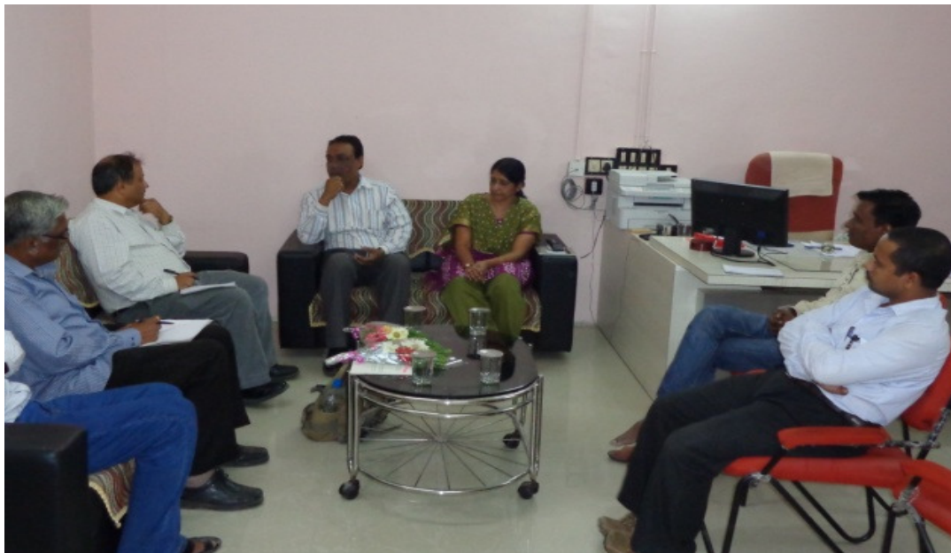
Visit of Officers of the ICRISAT, Hyderabad